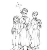
ALTAR SERVER A JOB SO BIG ONLY A KID CAN DO IT